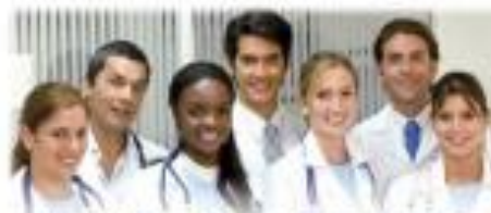
Health Care Career Opportunities