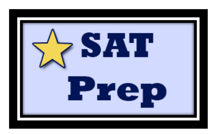
*Western Wayne is a testing site